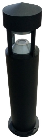
LED BOLLARD BOLED 01X